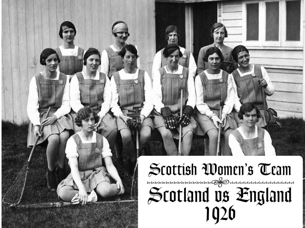
Scottish Women's Team Scotland vs England 1926