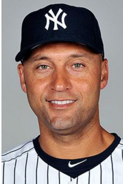
Derek Sanderson Jeter

Nicknames Mr. November, The Capitan, Captain Clutch, or DJ